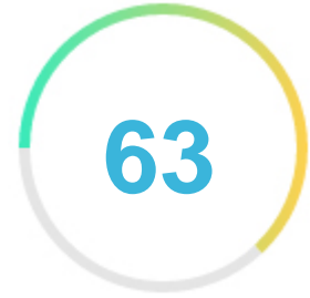
Your Website Score